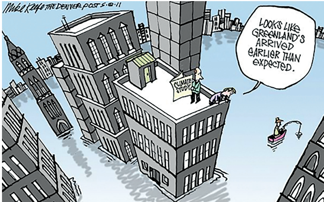
Fig. 1 – A cartoon about climate change