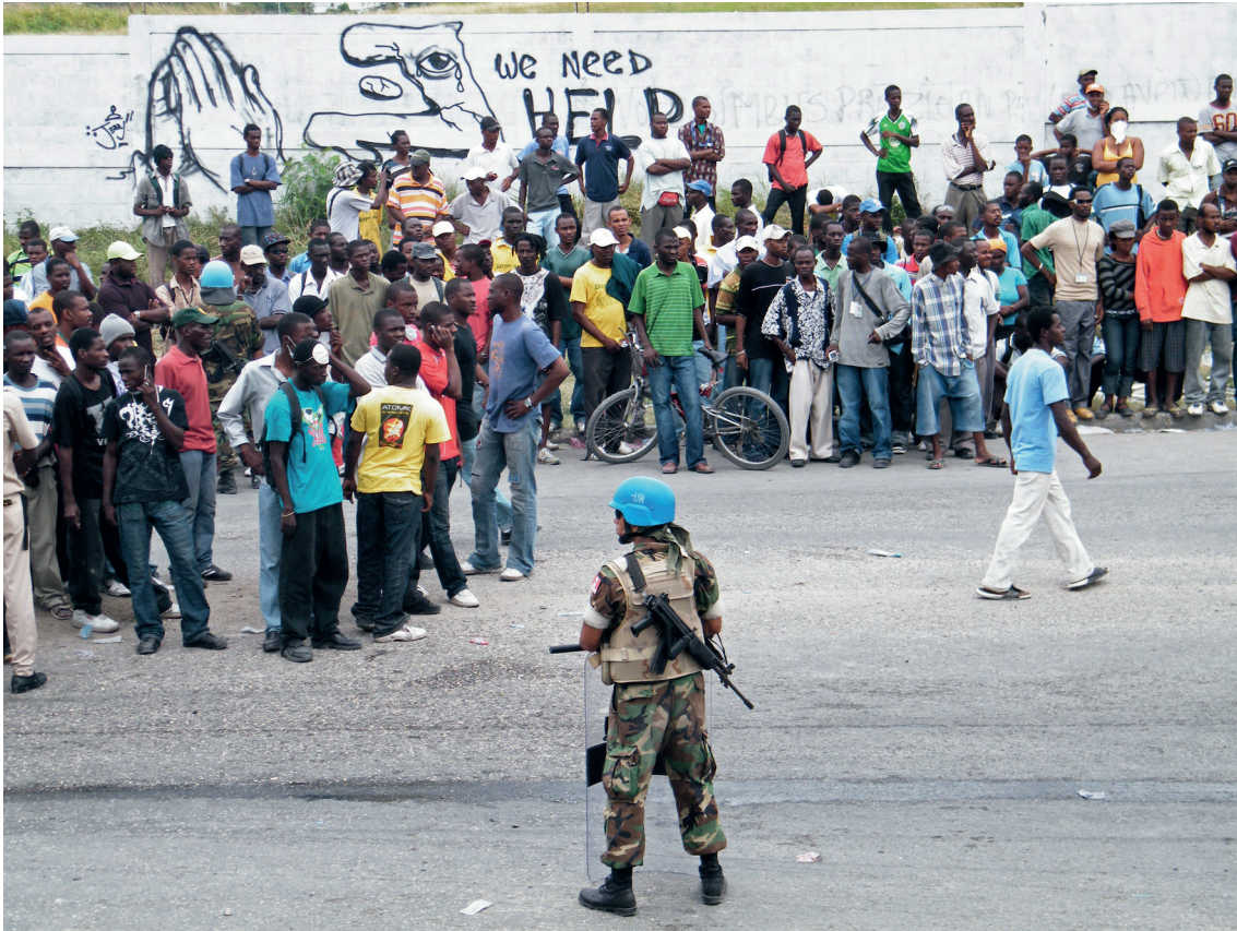
Fig. 5 – A United Nations peacekeeper watches over Haitians at an aid centre after an earthquake, January 2010