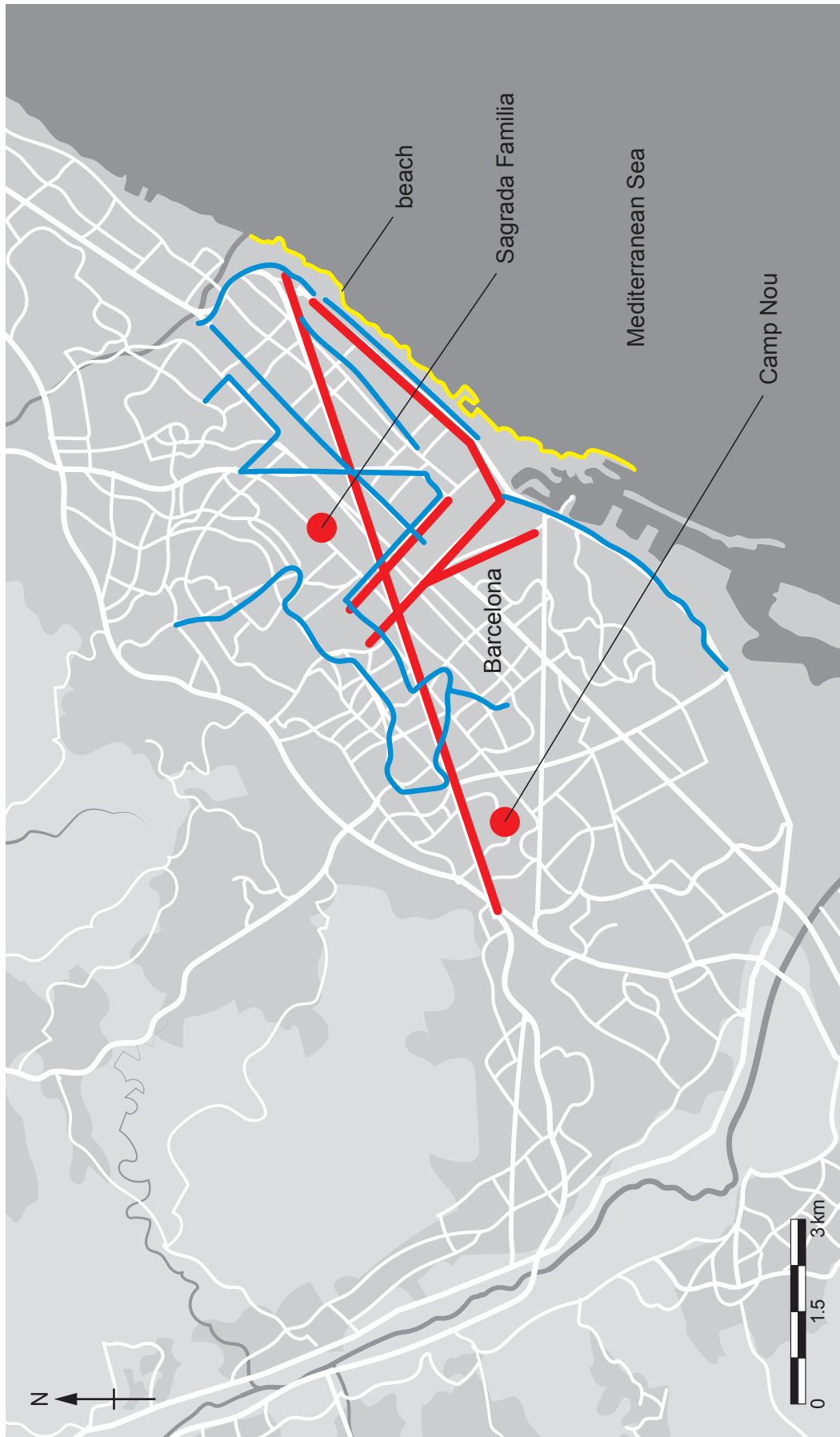
Fig. 5 – Crowd-sourced data of geo-located photographs taken by tourists (in red) and locals (in blue) in Barcelona, Spain

Key: Camp Nou = home of Barcelona Football Club Sagrada Familia = part of a UNESCO World Heritage Site